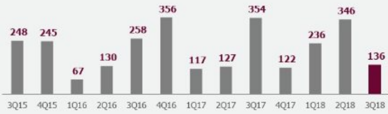
Net Sales (R$MM)